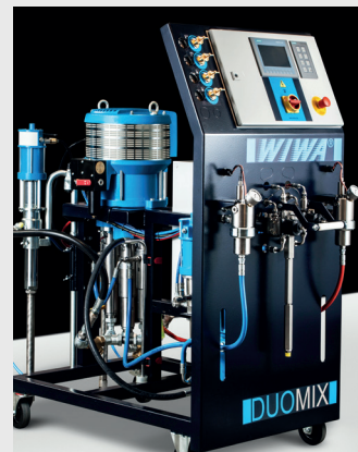
WIWA DUOMIX, pneumatic plural component spray equipment