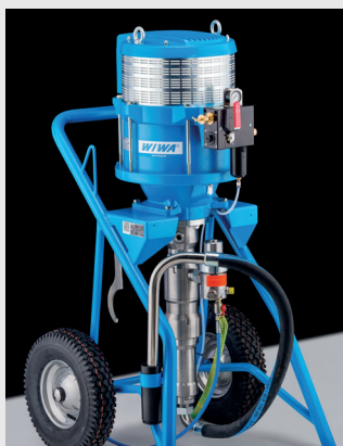
WIWA HERKULES 333 GX, single feed (airless) spray equipment