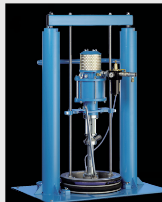
WIWA VULKAN, pneumatic extrusion equipment