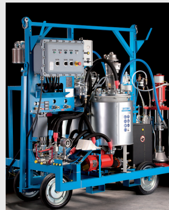
WIWA DUOMIX 333 PFP ATEX, for intumescent fire protection material