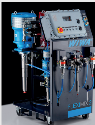
WIWA FLEXIMIX 2 ATEX, electronic plural component spray equipment

WIWA's extensive product range includes 1K, 2K and 3K application equipment for painting, coating and bonding in the machinery and vehicle manufacturing industries and for large surface, high viscosity and high build coatings used in the marine and offshore industries and steel and masonry construction for corrosion-proofing, surface sealing and passive fire protection.