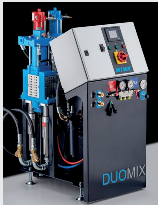
WIWA DUOMIX PU HX, hydraulic plural component spray equipment